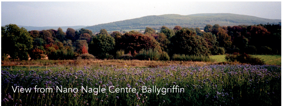
View from Nano Nagle Centre, Ballygriffin