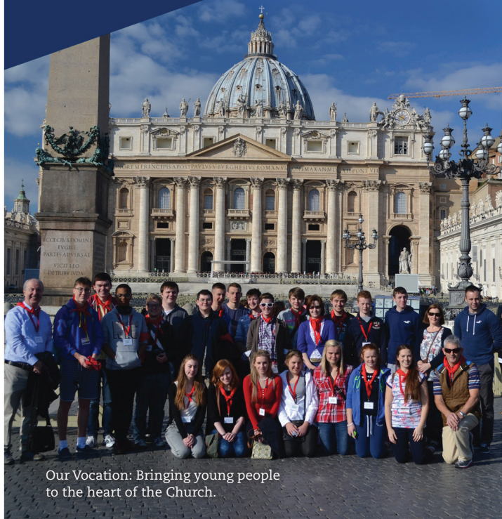
Our Vocation: Bringing young people to the heart of the Church.

We follow Christ as religious brothers. Our mission is evangelisation – bringing the message of Christ to young people today. If you think the Lord is calling you to this exciting mission, then we'd love to hear from you!